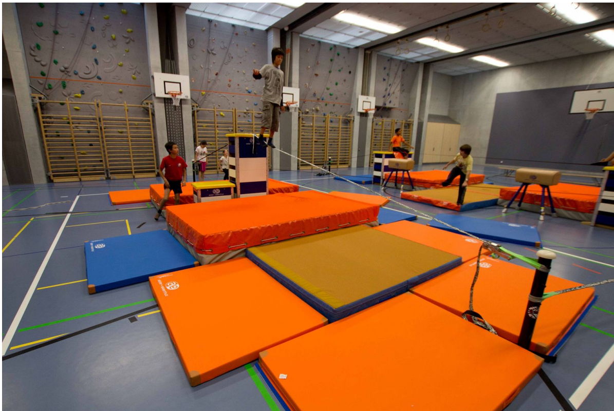
Fig. 6: A redirected and thus shortened slackline (note the padding at the point of redirection). The slackline poles are subject to angled loads. The falling area is widely protected with mats.